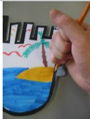
Making a hole for the elastic

Make two holes for your eyes in the same way, then widen them out carefully using scissors.