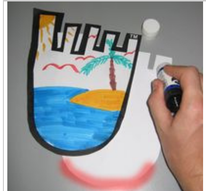
Glue the edges together

Put a thin line of glue right around the edge of one of the outlines (make sure it is not the side you have decorated), but leaving a gap at the bottom (marked in red on the photo). It helps to put glue over all of Striders toes!