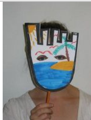
The finished stick mask

Stick a pencil to the back of the outline (in the same way as for the stick puppet), then carefully cut out some eyes.