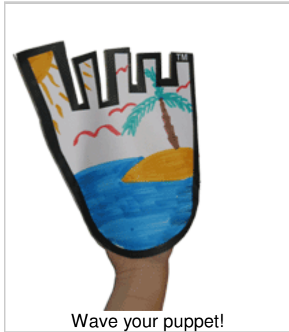
Wave your puppet!

Once you have put on the glue, stick the two layers together. When the glue is dry, slide your hand into the space between the card and wave your puppet!