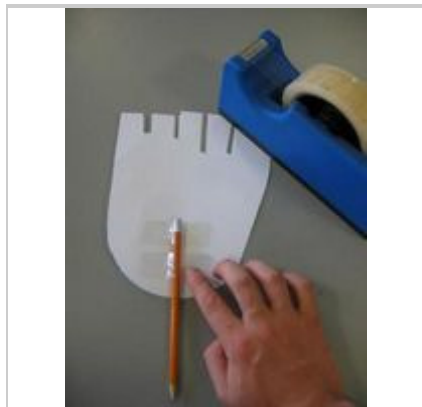
Stick a pencil to the back

You can then wave the puppet from side to side.