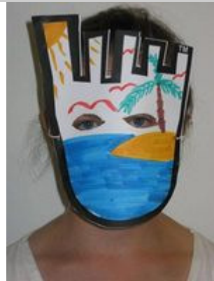
The finished elastic mask

Tie some elastic or string to one of the holes, then adjust it to fit and tie off the other end.