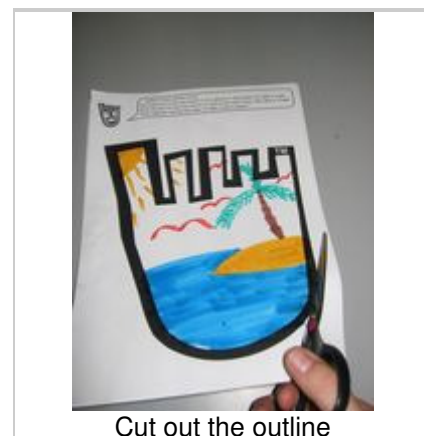
Cut out the outline